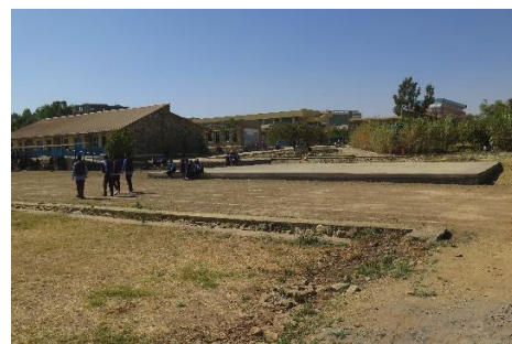
Completed sports work in December

2018: landscaping work and small site improvements were made in all schools. In addition the KG toilets were renovated as they are now more than 15 years old.