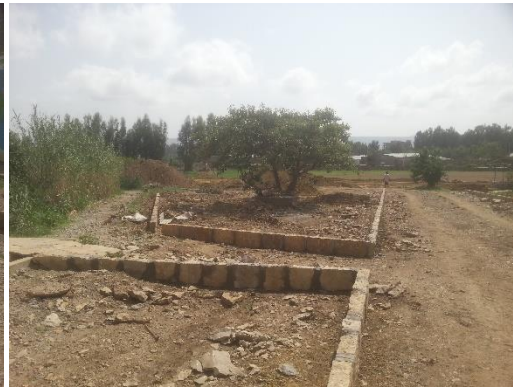
Landscaping the road leading to the running track, work in progress, July 2017