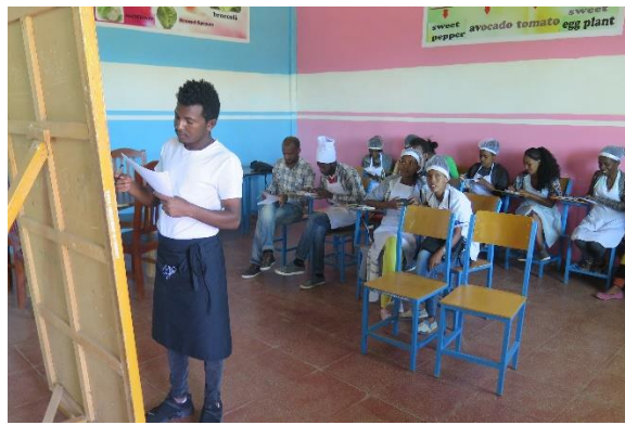
Students in the new food preparation training workshop