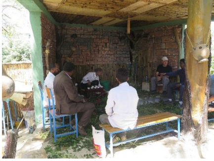
Traditional coffee area