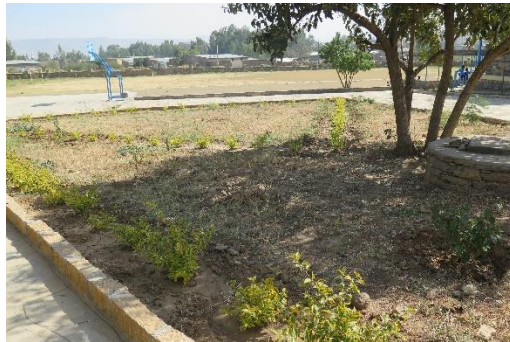
Landscaping in the secondary school

2019: ICT training has started with a trial in March 2019 and a course for teachers was run in the summer vacation. Entrepreneurship training started in May 2019 and a second successful intensive course was run by PUM in November 2019. A traditional house has been built as a cosy break-out area to encourage spoken English. In the staff café area, a traditional coffee house is now used to entertain guests and celebrate special occasions and the café area has been extended.