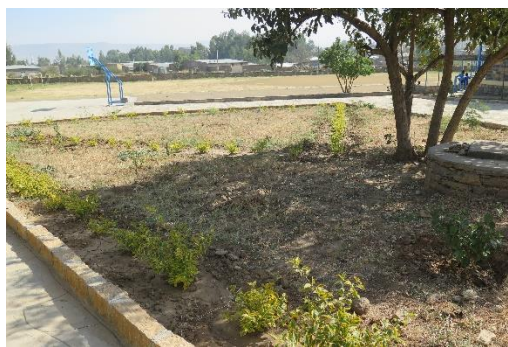
Landscaping in the secondary school

2019: ICT training has started with a trial in March 2019 and a course for teachers was run in the summer vacation. Entrepreneurship training started in May 2019 and a second successful intensive course was run by PUM in November 2019. A traditional house has been built as a cosy break-out area to encourage spoken English. In the staff café area, a traditional coffee house is now used to entertain guests and celebrate special occasions and the café area has been extended.