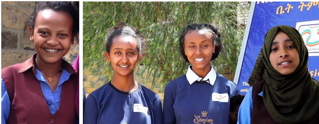
Our scholarship students