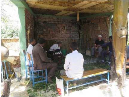
Traditional coffee area

Leadership Academy and a second student joins in the autumn of 2020.. All with full scholarships. Our students continue to apply for these opportunities in 2020 and beyond.