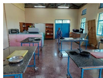
preparing for college start-up