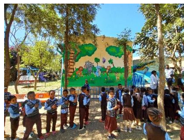
Beautiful gardens (KG)