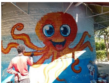
Decorating the KG

We are now confident to open the Nicolas College and help students who do not want to attend university find alternative ways to support themselves and learn about business. The first courses start in January 2025.