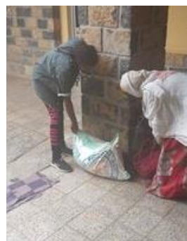
A few solar panels provide power to staff and services a student and her mother collect food from school

2022: School classes re-started for students from Kindergarten to Grade 6. The classes continued for 6 months and the city was bombed again. IN November 2022 the Pretoria Agreement for the Cessation of Hostilities was signed, attaches on the city stopped and plans were made to resume school.