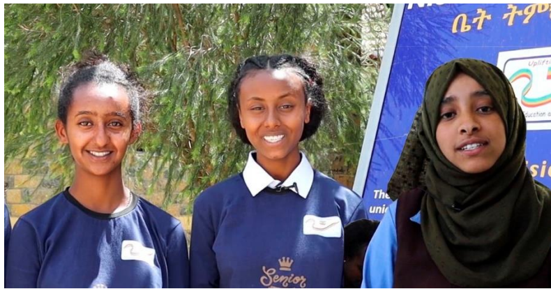
Our scholarship students

2020: The year started with ambitious plans for further developments at the school. Under consideration were a STEM centre (Science, Technology, Engineering, Maths). Also we started the investigation of the installation of solar panels for the provision of constant electricity of more critical classrooms and facilities in the school. During the late spring we worked with Mekele University volunteers as well as the Mekele Institute of Plant technology to plant seedling trees and bamboo to grow at the school, as part of a re-greening project. Other areas were set up for growing vegetables, eventually for sale to the staff and community. To help this project, REST (Relief Society of Tigray) donated and installed a borehole on the site for the school.